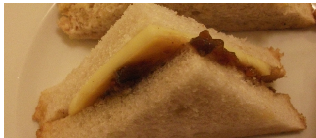
Cheese and pickle sandwich – Parker's metaphor for healthy co-existence...

In the figure below, I have sought to illustrate the playing situation as Parker describes it in a triangular pattern. Players are seen as independent forces, between which "initialising" and "responding" takes place, and the third interacting force is the music language.